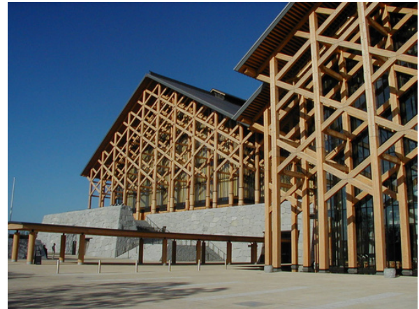
Venue: Ehime Prefectural Budokan