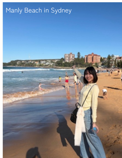
Manly Beach in Sydney

On a personal note, there are many things I am looking forward to as well. This is my first time visiting the Australia/New Zealand region, as well as my first time living abroad for an extended period. I hope to stay curious and enjoy the many new discoveries that everyday life will bring. I love the ocean, so I would like to visit as many beaches as possible and take in their beauty. I recently went to Manly Beach in Sydney, and would love to try surfing! I am a complete beginner, so if anyone has experience, I would greatly appreciate any advice.