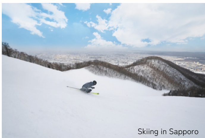
Skiing in Sapporo