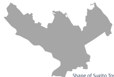
Shape of Sugito Town