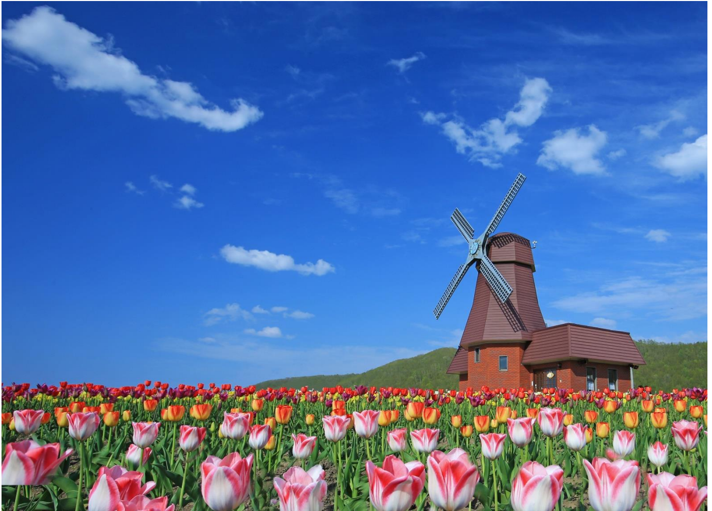
Kamiyubetsu Tulip Park in Yubetsu Town