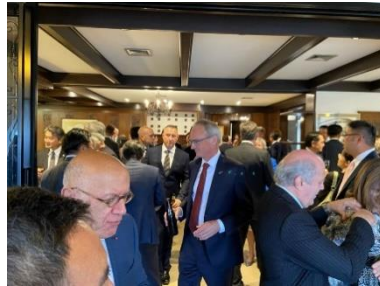
Reception in Sydney