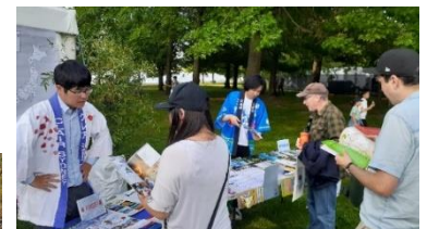
Canberra Nara Candle Festival