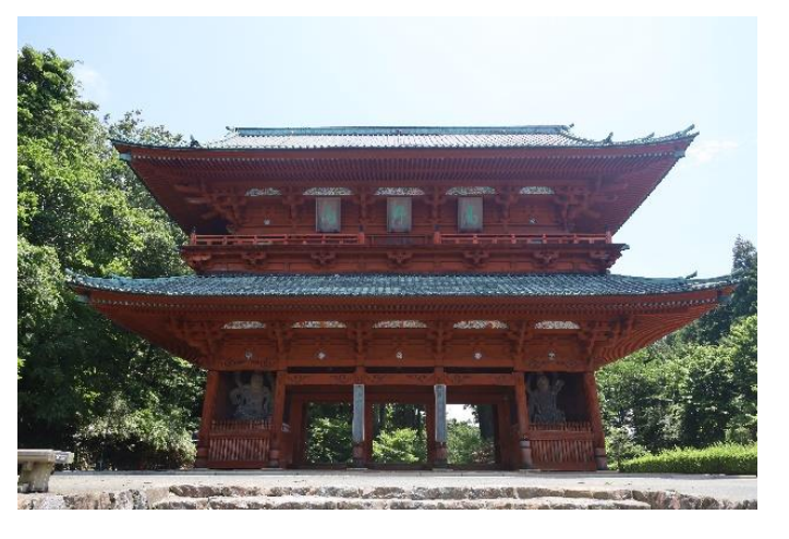
Temple lodging on Mount Koya

The World Masters Games is an international competition where any sports lovers over the age of 30 can compete. The Games will host a total of 59 disciplines in 35 sports, of which seven disciplines in five sports will take place in Wakayama Prefecture: sailing, windsurfing, dance sports, indoor volleyball, rifle shooting, half marathon and 'Ekiden' (long-distance relay running).