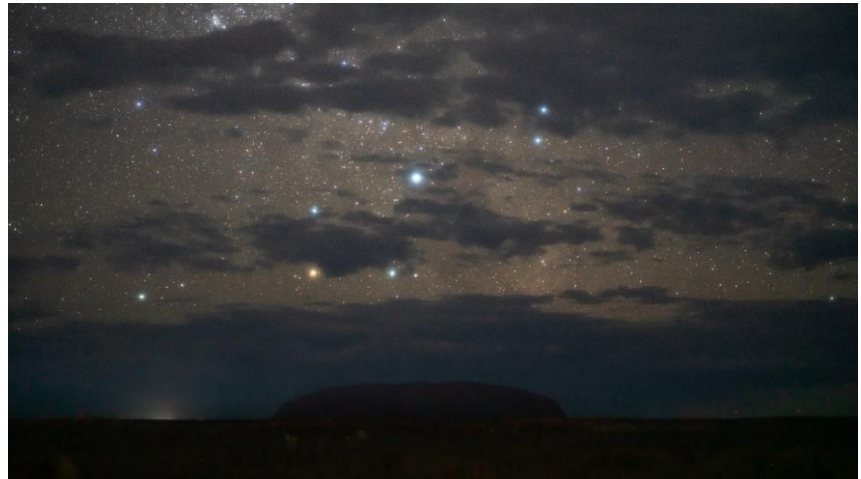
Taken at Uluru

I like to take photos and during the two years here I was able to travel to different places to take photos. The two photos you can see were taken during my trip to Uluru in Australia and Lake Tekapo in New Zealand.