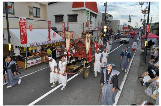
Mikoshi, portable shrine, for Japanese Kami sama god

of Japan as a country of people who value their roots, love their families and enjoy a good party, too.