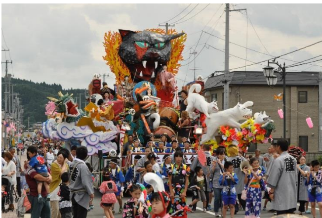
Giant decorative 'Dashi float'

On paper, Rokunohe is a small, quiet rural town in the big prefecture of Aomori. However, over the course of three days in late September, Rokunohe's Aki Matsuri (Autumn festival) transforms this quaint locale into a buzzing hive of energetic festivity. Most tourists are drawn to Aomori by the promise of bombast and spectacle at its famous Nebuta Matsuri where a large assortment of giant decorative dashi floats are paraded to stunning effect through the streets of the city. Not to be outdone, Rokunohe's Aki Matsuri also features a