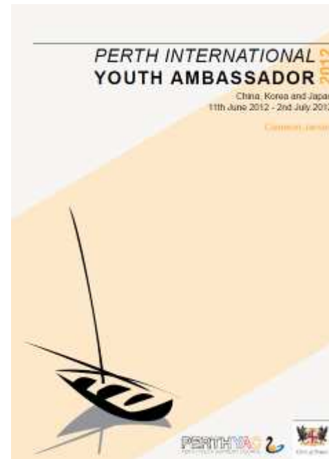
International Youth Ambassador report