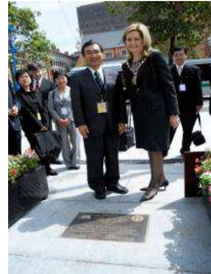
Kagoshima Perth 35 th Sister City anniversary