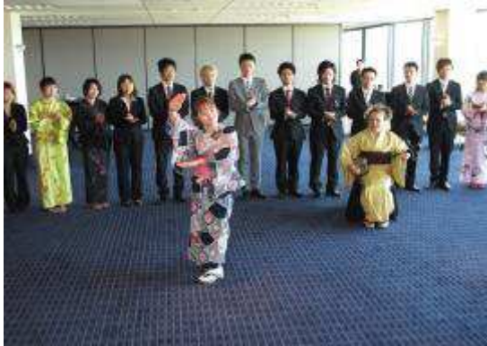
Minami IBS group Kagoshima