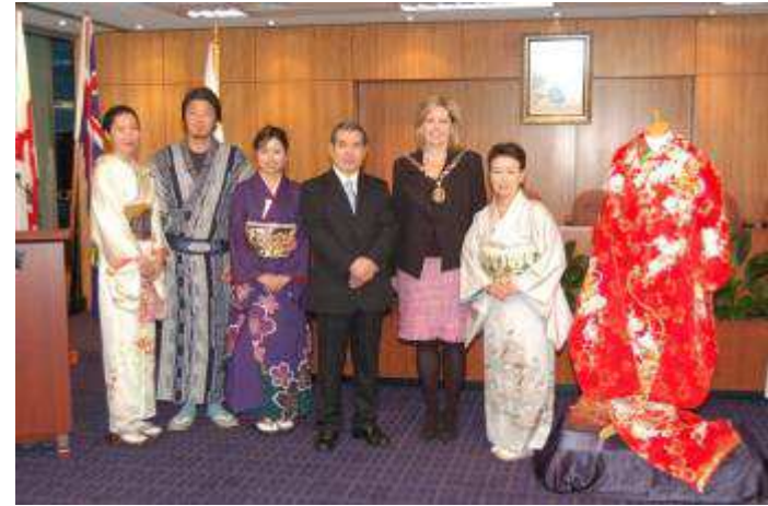
Wedding Kimono reception