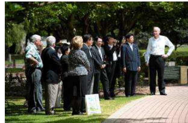
Kagoshima Park Burswood