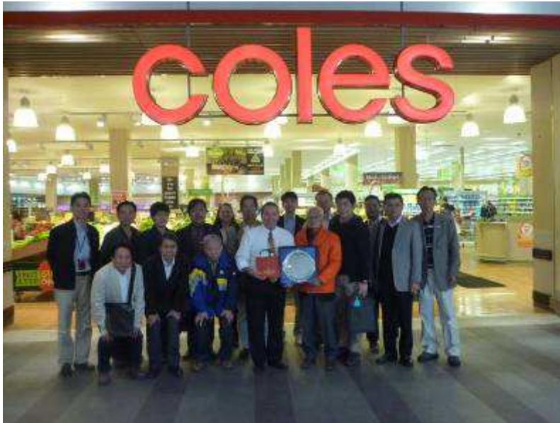
Kagoshima Bank agribusiness delegates