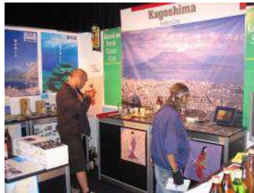
Guest Nation Pavilion