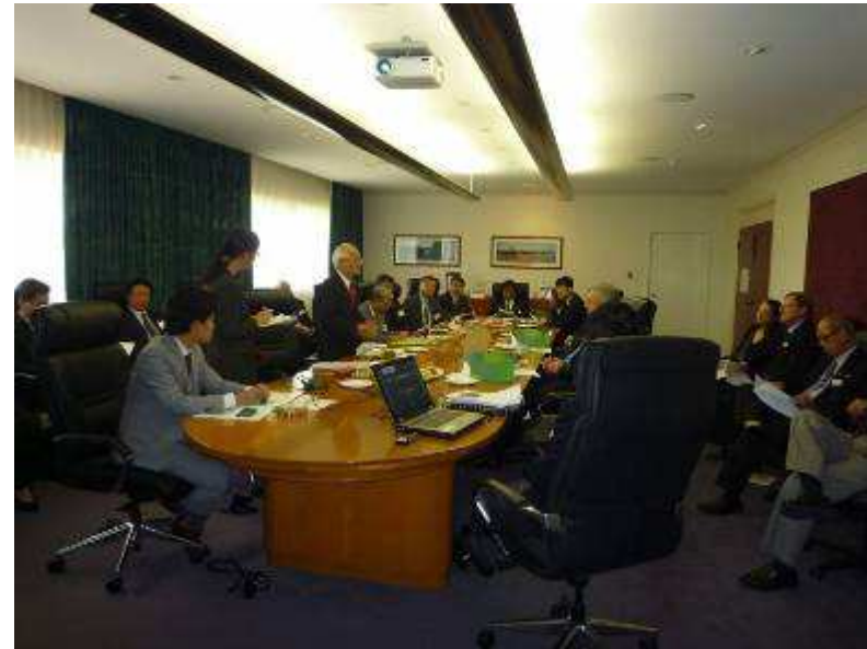
Kagoshima agribusiness delegates at DAFWA briefing