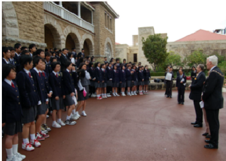
Large student excursion visit