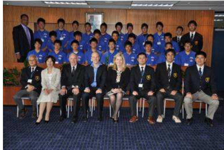
Kagoshima U 17 Prefectural Rugby Team