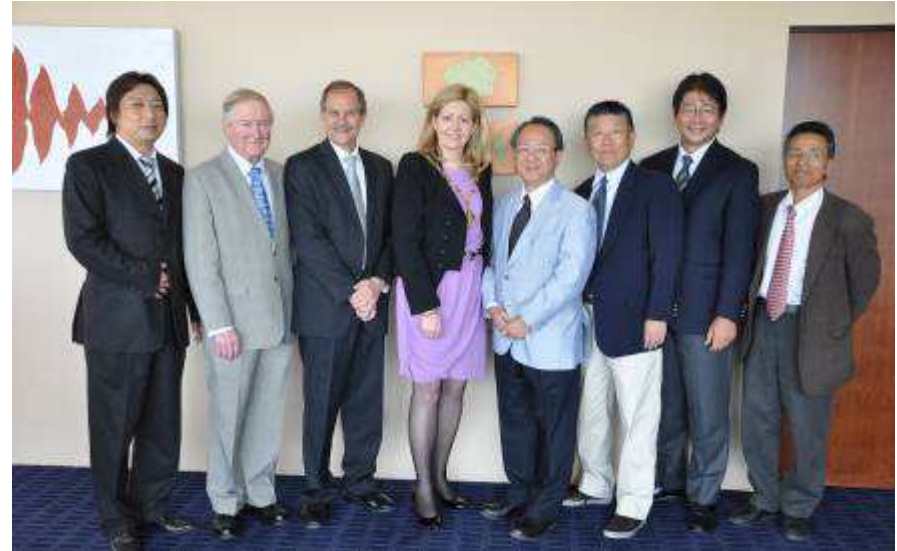
IROM Japan medical group and WAIMR