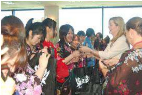
Immaculate Heart College students