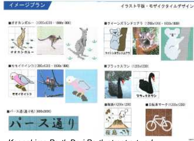
Kagoshima Perth Dori Perth street artwork