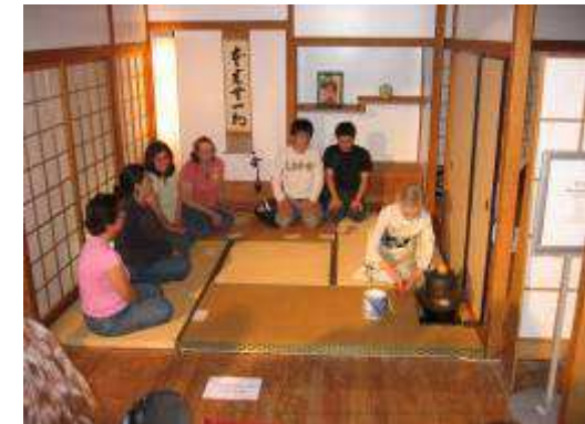
Japanese Tea House donated