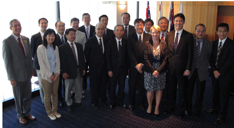
Fukuoka study tour