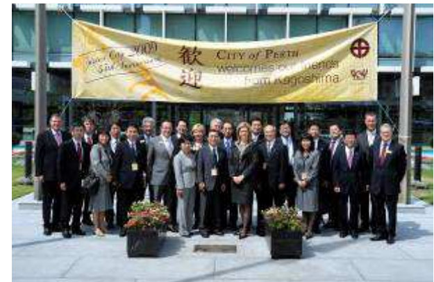
Kagoshima Perth 35 th Sister City anniversary