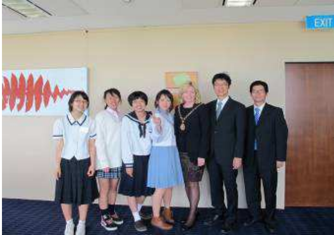
Student group with Consulate staff