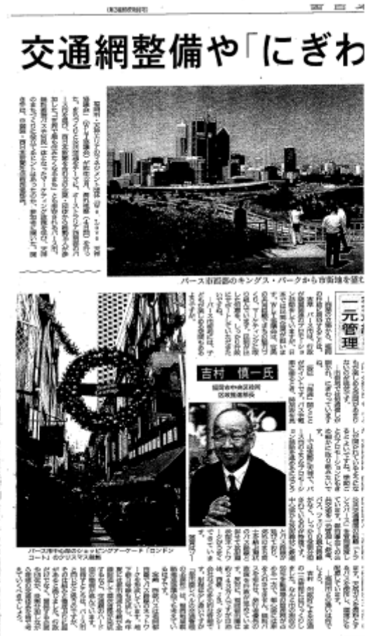
4 page coverage in Nishi Nihon Newspaper