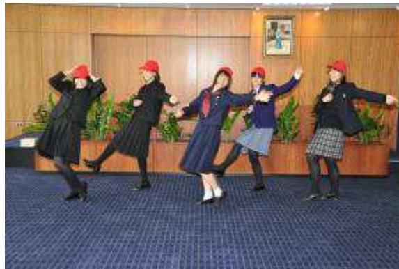
Youthwings Student visit