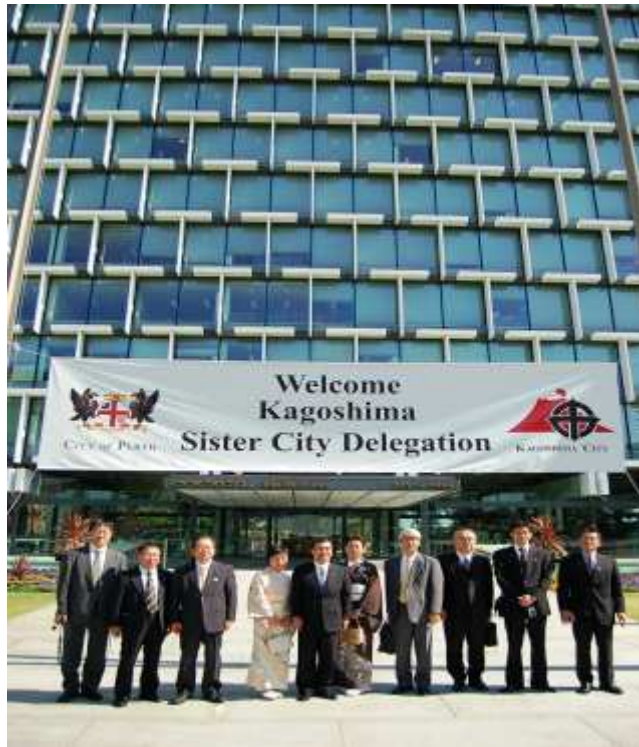
Kagoshima Sister City Delegation