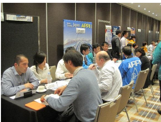
Business consultations in Sydney

Come have a great snow experience in Japan this summer!