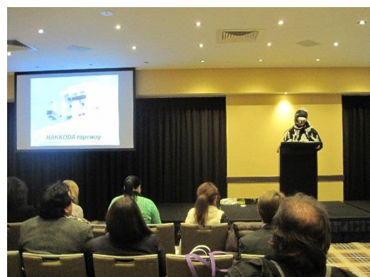
Presentation in Sydney