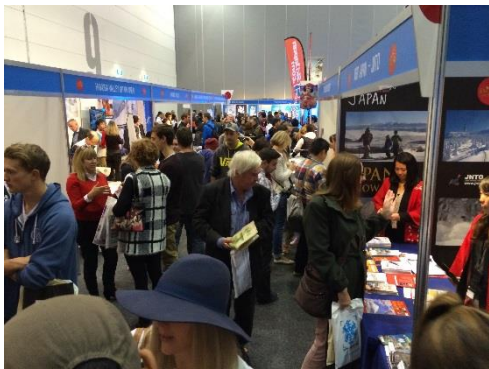
Japan related booths

With the support of CLAIR Sydney, the Hokkaido Tourism Organization, Tohoku Tourism Promotion Organization, Nagano region and Niigata region each ran booths at the Expo to further encourage and promote visits to their respective ski resorts.