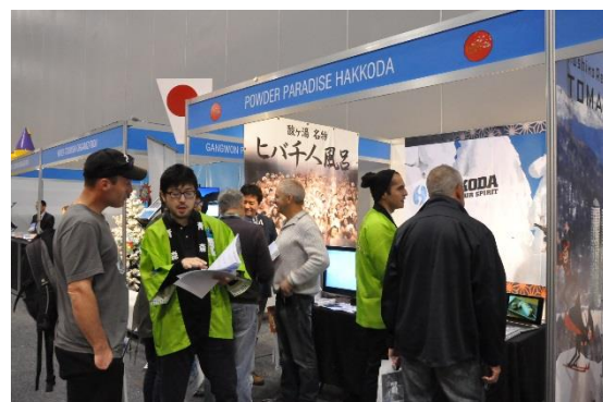
Hakkoda ski resort booth

The day after the Expo in both cities, the Japan National Tourism Organization (JNTO) organised seminars catered for Australian travel agents, whom the exhibitors gave talks and presentations to.